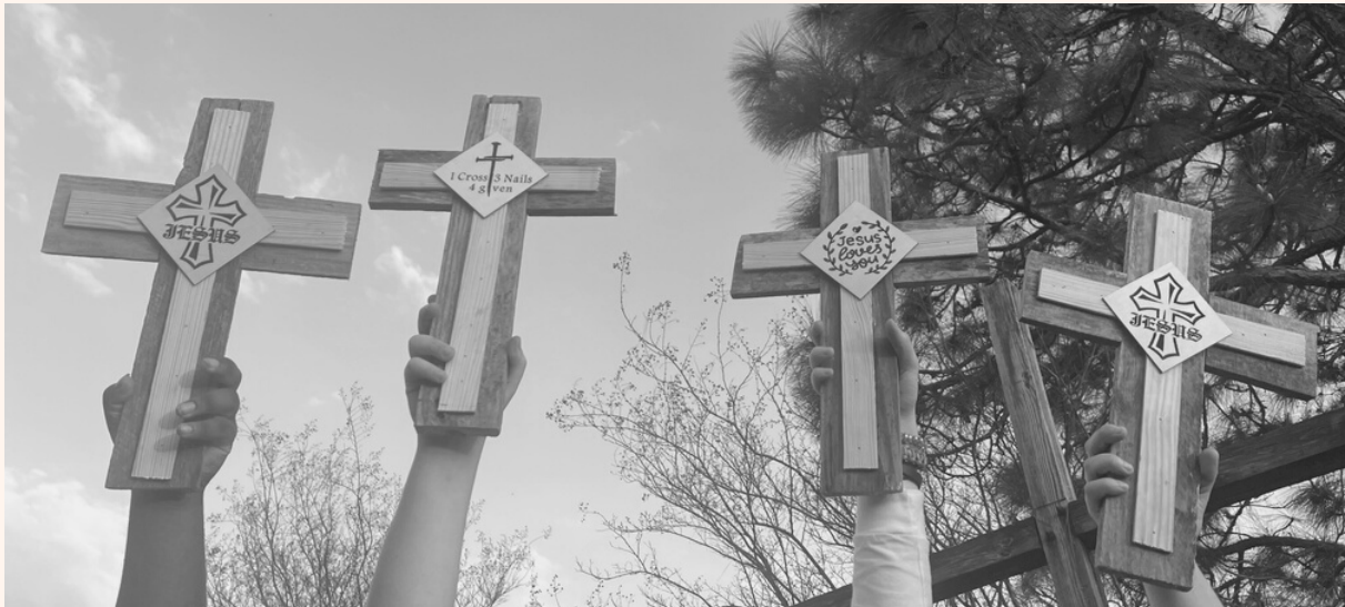
Youth learned measuring skills and laser engraving to create these beautiful wooden crosses